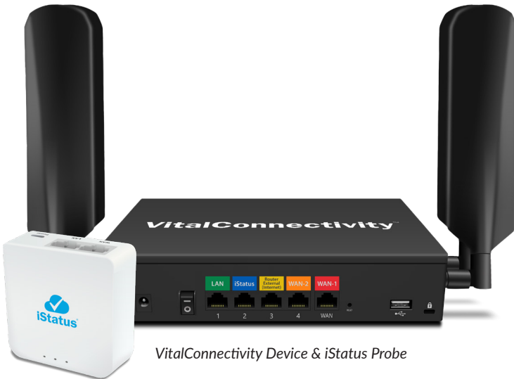
VitalConnectivity Device & iStatus Probe