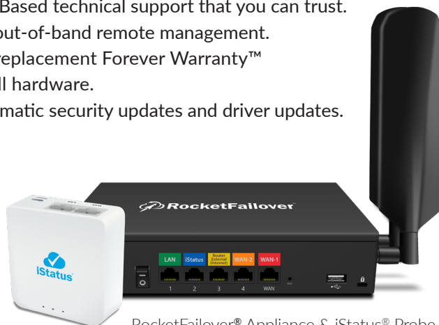
RocketFailover® Appliance & iStatus® Probe